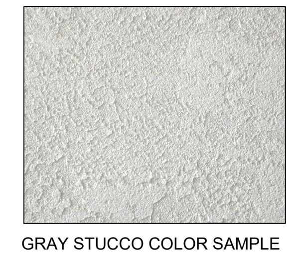
GRAY STUCCO COLOR SAMPLE